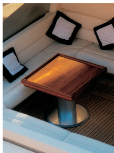
M.Y. MILLENIUM 55 - OTAM

ART. 0316-AN: ADJUSTABLE HEIGHT BY ELECTRIC STRUT AT 24 V; STRUCTURE TO BE COVERED.